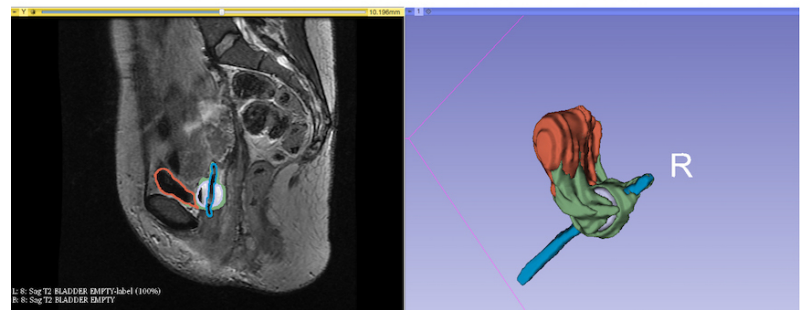
(b) Cath A Empty

(a) Cath A Full (bladder dimmed for clarity)