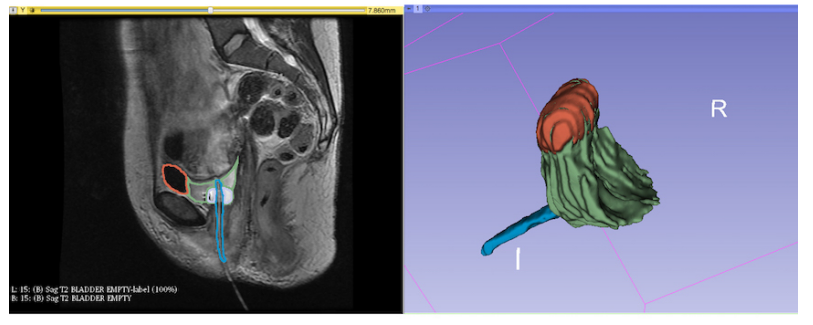
(a) Cath B Empty