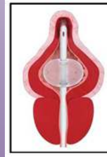
Conventional Foley Catheter design