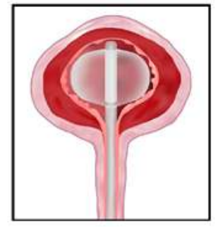
Kohli Atraumatic Catheter design